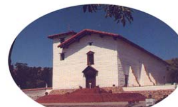
Mission San Jose Founded 1797

The Rotary Club of Mission San Jose meets every Friday at 12:15 PM at the SpinAYarn Restaurant 45915 Warm Springs Boulevard in Fremont.